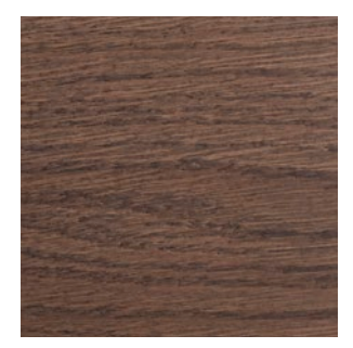
Walnut Stained Oak