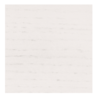
White Stained Oak