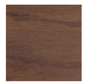
Ash Grey Oak