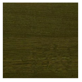
Green 21 Oak Stain