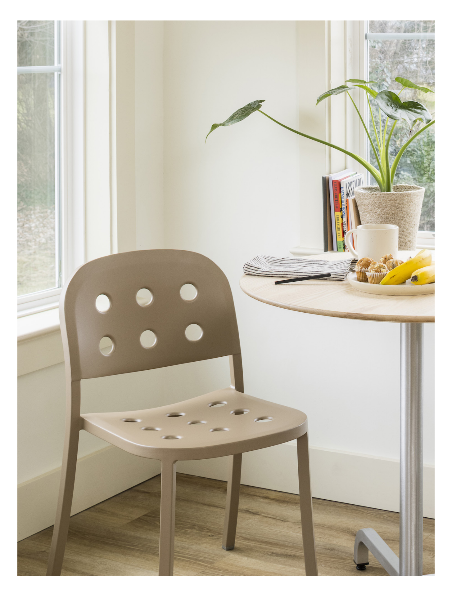
Emeco's in-house powder coat colors are available for all 1 Inch chairs, stools and tables.