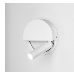
Ledtube R Right