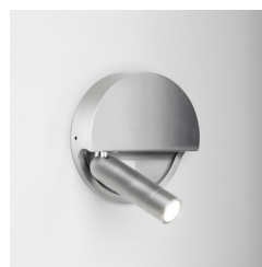
Ledtube R Left