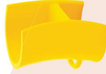
Yellow 1665 C