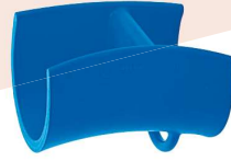
Blue 1252 C