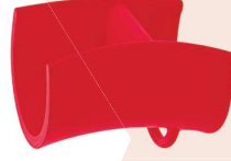
Red 1004 C